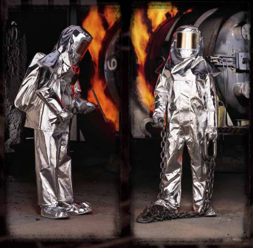
Left, the 300 Series Approach Suit, featuring a coat and pants. Right the 305 Series Approach Coverall.

hese heat reflective 300 and 305 Series Approach Suits are designed for personnel engaged in maintenance, repair and operational tasks in areas of low ambient, high radiant heat, much the same as our 500/505 Series. However, the 300 and 305 Series Approach Suits have no moisture/steam barrier, making these garments suitable for situations where exposure to hot liquids, steam or hot vapor is not a possibility.